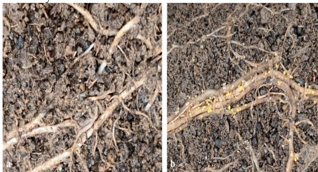
Screening for PCN resistance. No cysts on the roots of genotype, SM/11-120 (Left), Cysts of both species present in the roots of Kufri Jyoti (right)

In advanced generation yield trials, SM/11-120 consistently out yielded all the controls for total and marketable tuber yields at 100-120 days crop duration at Kufri. The hybrid out yielded the control variety, Kufri Girdhari by a margin of 71.6%, Kufri Himalini by 68.75% and Kufri Jyoti by 238.5% for total tuber yield over the last 4 years. During three years of evaluation under controlled conditions the hybrid observed highly resistant reaction to both G. rostochiensis and G. pallida and not even a single cyst of both the species of PCN was observed in root balls of the hybrid.